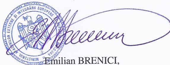
Emilian BRENICI, Șef al Direcției Generale Drept Internațional a Ministerului Afacerilor Externe și Integrării Europene al Republicii Moldova

Prin prezenta confirm că textul alăturat este o copie certificată de pe Acordul de finanțare dintre Republica Moldova și Asociația Internațională pentru Dezvoltare în vederea realizării Proiectului "Suport de urgență pentru agricultura Moldovei" (Chișinău, 29 mai 2013), originalul căruia este depozitat la Arhiva Tratatelor a Ministerului Afacerilor Externe și Integrării Europene.